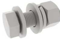
Hex Screw kit