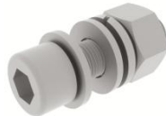
Hexagon Screw Kit