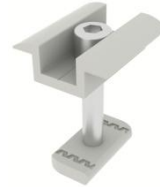
Mid Clamp Kit