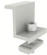
End Clamp Kit