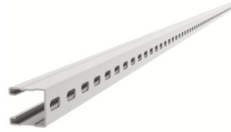
Ground Rail / Back Support