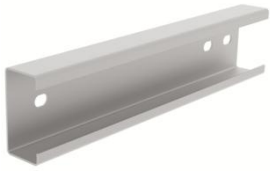
Front Leg / Back Leg